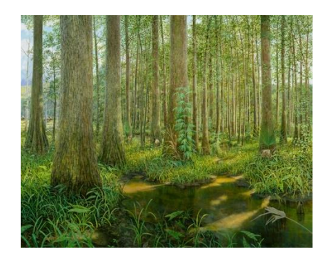
Pole Forest Garden of the Gods 300 million years ago

Slimy Shoreline Roxborough State Park 250 million years ago